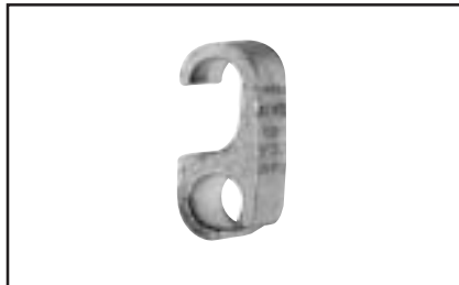
Figure "6" -shaped, wide range-taking copper, compression tap connector for primary service taps and secondary service drops. Connector can be gripped in tool and slipped over the line for easy installation.