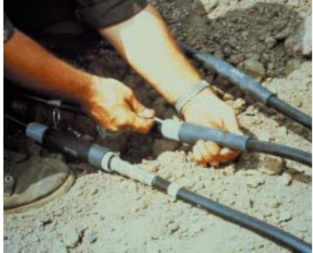
Cold Shrink 8426-9 Splice